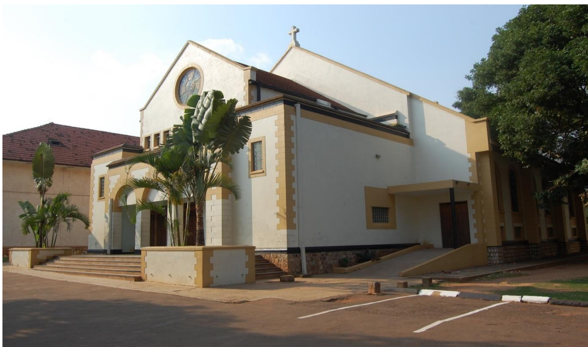
St. Augustine Chapel