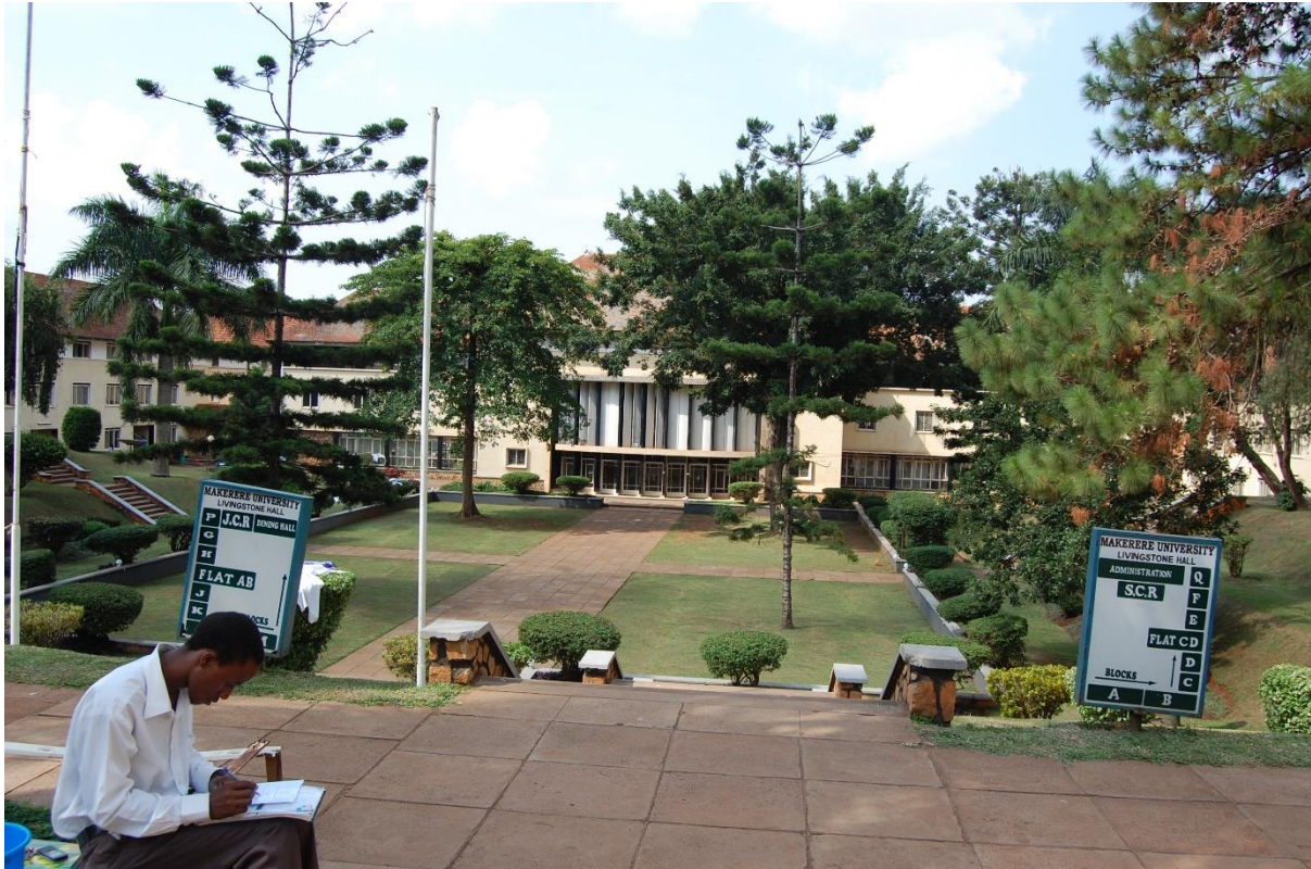
Undergraduate Hall of residence