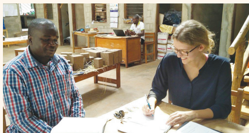
MUBS- CBS students out in the field