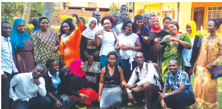
Participants in a group photo after the training

The MUBS ICT Centre, in partnership with the Federation of Small and Medium Enterprises in Uganda (FSME) successfully conducted training for 250 SME business owners in Mbale Municipality. The training, whose theme was “Digital Literacy as a catalyst for innovation and