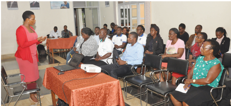
Director Entrepreneurship Innovation and Incubation Centre addressing entrepreneurs at the monthly breakfast meeting. She challenged the business people to stay relevant in the market by taking advantage of technology.