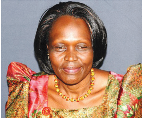
Hon. Beatrice Atim Anywar