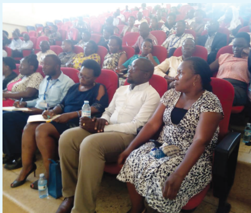
Some of the staff who attended the Seminar

The half day Sensitization Seminar was organized by the Human Resource Directorate under the