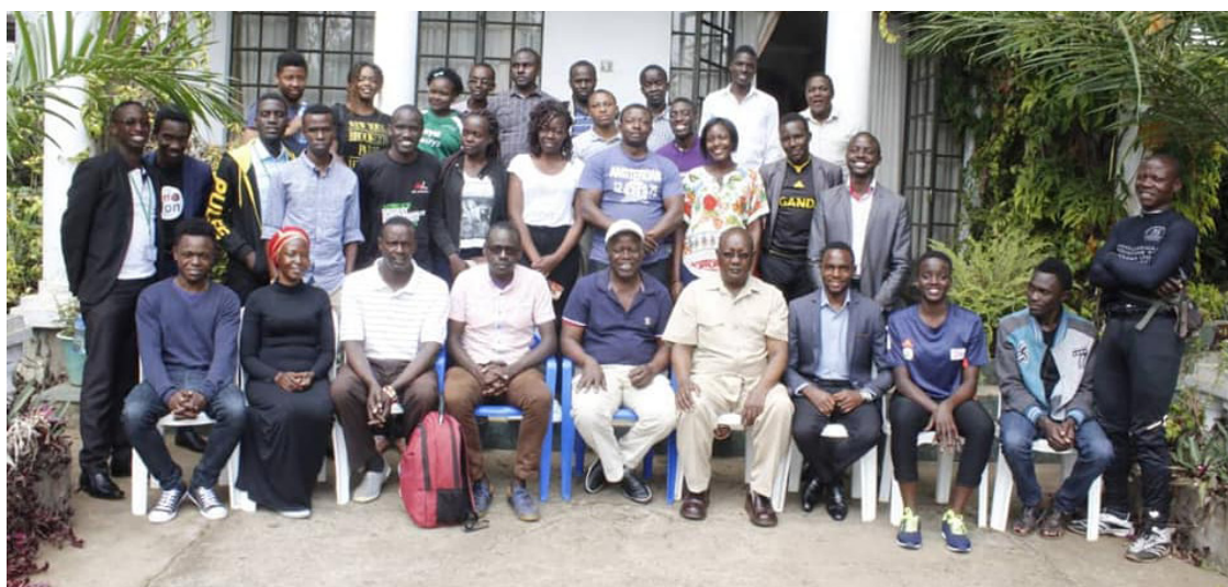
MUBS Guild Executives with the students and staff from Moi University at Entebbe for a workshop.