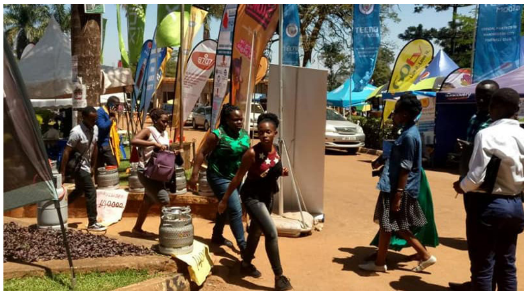
Students and staff arriving at the Bazaar ground to have themselves some cheap merchandise