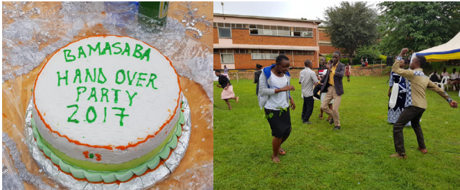
Bamasaba celebrating their new executive

THE MUBS JINJA CAMPUS BAMASABA STUDENTS ASSOCIATION at the MUBS Jinja Regional Campus held a hand over party at the YMCA. At the ceremony, the incoming executives were cautioned against tribal discriminations. They were asked to follow the steps of the out