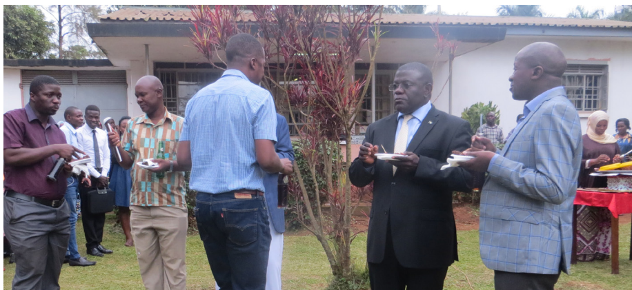
Members of MUBS Management sharing lite moments at the cocktail.