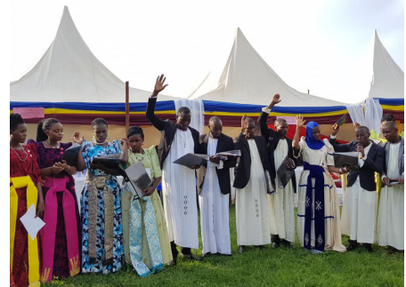
Basoga Nseete new executive swearing in

MUBS JINJA REGIONAL CAMPUS ABASOGA NSEETE ASSOCIATION held a hand over ceremony for the outgoing executives at Jinja MUBS YMCA campus on July 20, 2018.