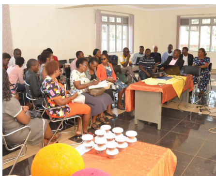
Participants of the August 2018 Entrepreneurship Breakfast Meeting at the MUBS Entrepreneurship, Innovation and Incubation Centre.