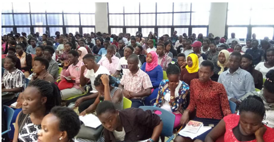
First Year Students being addressed by MUBS Management at the MUBS Main Library.