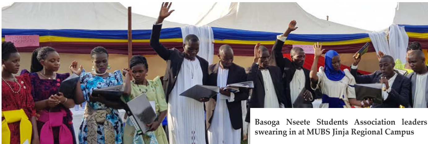
Basoga Nseete Students Association leaders swearing in at MUBS Jinja Regional Campus