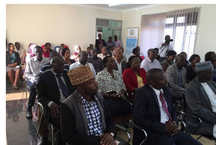
Students and Staff of MUBS during the signing of the MOU with CECF at the MUBS Entrepreneurship, Innovation and Incubation Centre.