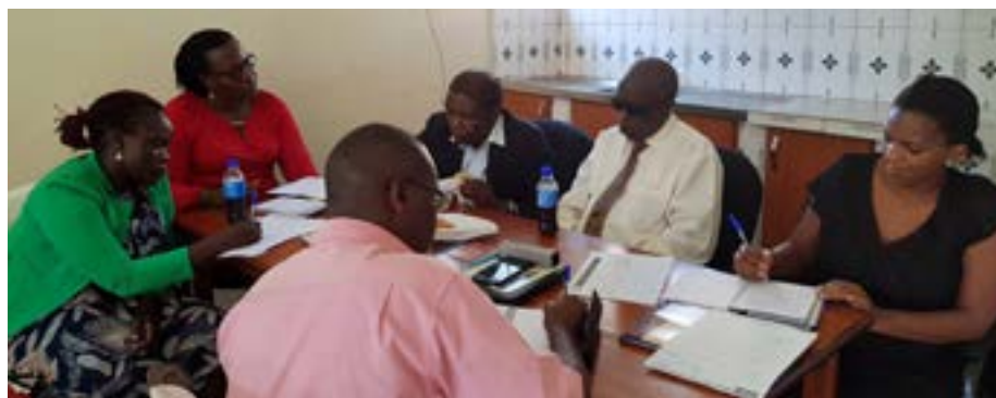
MUBS and UNAPD team discuss PWD issues in MUBS

On July, 18, 2019 a team from Uganda National Action on Physical Disability (UNAPD) MUBS staff met to discuss the level of Inclusion of Disability Concerns at MUBS. The meeting was between the Office of the Dean of Students, the MUBS