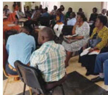
On August 21, 2019, Entrepreneurs met at MUBS Entrepreneurship Innovation and Incubation Centre for a Breakfast Meeting. They shared about improving efficiency by improving time management. This is a monthly meeting which has provided the small business owners an opportunity to network and learn from each other. This meeting also gives them a chance to sell and market their products.