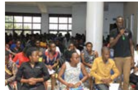
Some of the first year students during orientation

Beginning this Academic Year, 2019/2020, the Uganda Revenue Authority took over the collection of tuition fees from Public institutions, including MUBS. All fees payments are to be received via the Uganda Revenue Authority (URA) portal. Students will need to generate a Payment Reference Number (PRN) through the students' portal on the AIMS system or from the Bursar's Office. URA has opened bank accounts in all banks that MUBS formerly held collection accounts and these include; Stanbic Bank, DFCU Bank, Centenary Bank and Barclays Bank. For more information, students are advised to contact the Bursar's Office. In May this year, the Ministry of Finance passed a directive to URA to collect fees from all Public Universities on behalf of government.