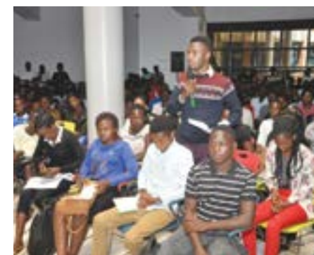
First year students touring the Campus

At the beginning of each academic year, the School Registrar's Office organizes the Students' Orientation week where first year students get