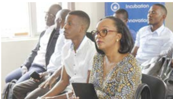
Incubatees during the training at the MUBS main campus