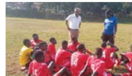
MUBS soccer team in training

The quarter-finals of the 2019 University Football League (UFL) officially get underway on Wednesday, September 4, 2019. The host, MUBS will face Uganda Martyrs University in the opening leg at the MUBS grounds. Meanwhile, Bugema University will host the reigning champions Kyambogo University, Busitema takes on Uganda Christian University (UCU) and St. Lawrence University will lock horns with YMCA.