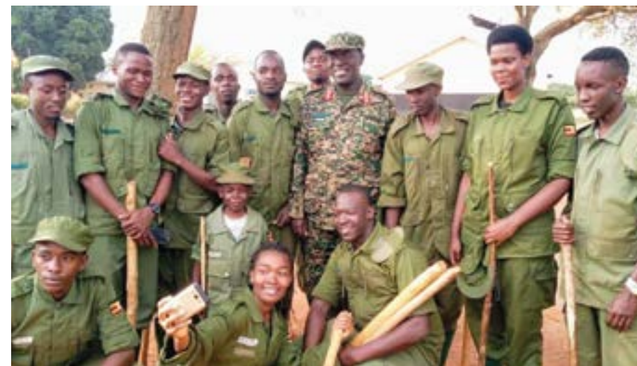
Hon. Philip Robert Ongadia, Prime Minister and Cabinet Ministers attended a leadership training at Kyankwanzi National Institute of Leadership.