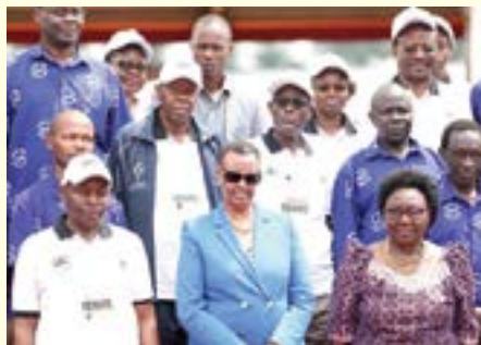
First Lady Hon. Janet Museveni in (blue) at the celebrations

She called upon fathers to live exemplary lives because they play a vital role in keeping the family together. She emphasized