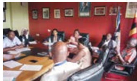
A group photo with the Faculty staff after the workshop

On August 2, 2019, the Faculty of Economics, Energy and Management Science held a meeting with Public Procurement the Disposal Authority (PPDA) to discuss how best they can implement the three year Memorandum of Understanding, (MoU) which they signed in February this year. The two institutions are collaborating in the area of promoting education and development, and industrial training for the Procurement and Logistics students. PPDA will be providing an opportunity to MUBS students to secure practical work experience that employers look for in addition to academic qualifications.