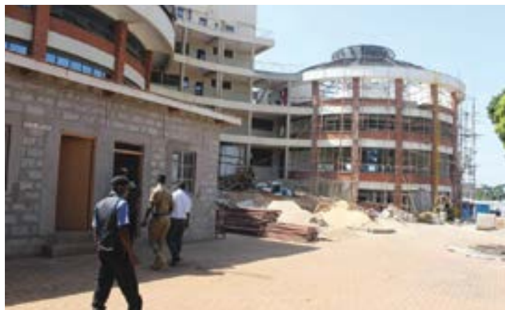
Continuing to improve MUBS infrastructure. The Library short tower is now completed.