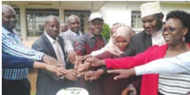
Eid al Adha celebrations at MUBS

On Wednesday August 14, 2019, the MUBS Community celebrated Eid al-Adha, which honors the willingness of Ibrahim to sacrifice his son as an act of obedience to God's command. The Muslim Community received ten (10) cows and four (4) goats for Eid-al-Adha celebrations from Mandela group of companies, Nile dialogue platform, Turkish Diyanet foundation and 3Z Foundation as sign of solidarity. The celebrations which took place