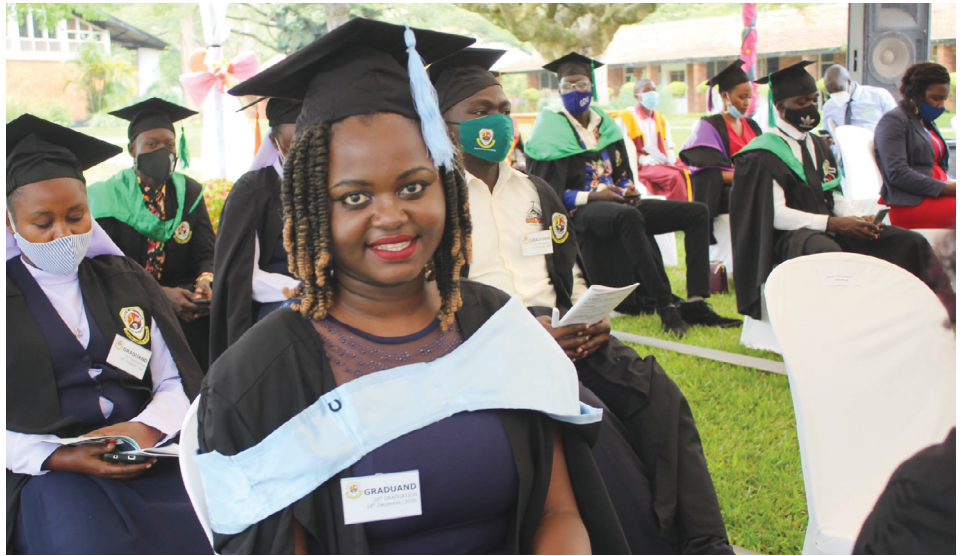
Uganda Martyr's University graduands

COVID-19 has exposed the vulnerable people, it has shown us that those people who are poor are more vulnerable, it has exposed inequalities among people. COVID-19 led to the shutdown of the education institutions, we locked down 14 million people in institutions and it led to bankruptcy. Uganda's economy is reported to have slowed down by nearly 50% in the financial