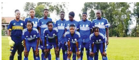
SHE-MUBS football club

THE MUBS-Women football team played to a barren draw (0-0) with Kawempe Muslim Women Football Club at Luzira Prisons Ground. Both sides could not find the back