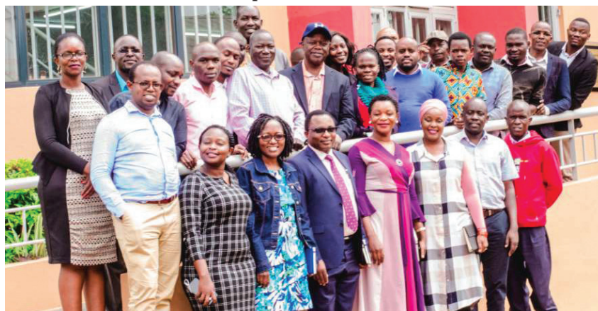
Wednesday, February, 10, 2020, the Entrepreneurship and Incubation Centre held a Capacity Building Training for MUBS-EIIC Mentors. The one day training enlightened mentors on what is expected of them and how to build the young entrepreneurs.