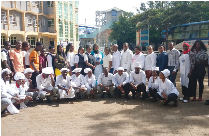
A team of seventeen (17) Catering students in the company of four team was in Nairobi for three day,

(4) academic staff from the Catering department of MUBS Jinja Campus visited Mount Kenya University on an exchange program.