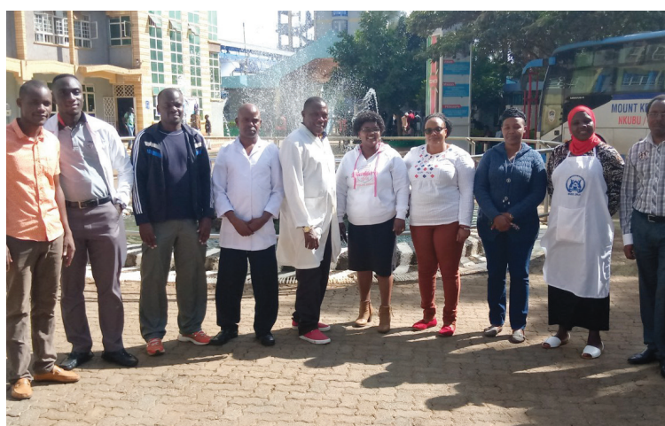
Some of the staff at the MUBS Jinja Campus, who accompanied the students to Mount Kenya University, during their students' exchange program