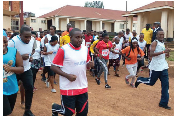
Staff, students and well wishers gathered at the MUBS Regional Campus, Mbarara to fundraise money for women with disabilities to get access to university education through the 3 rd MUBS Alumni run.