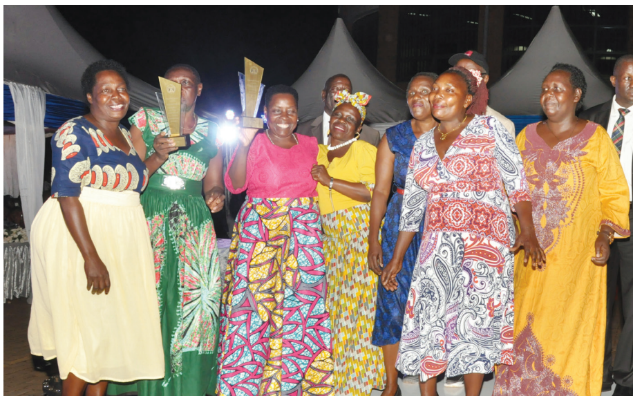
Some of the staff celebrating after receiving the long service award