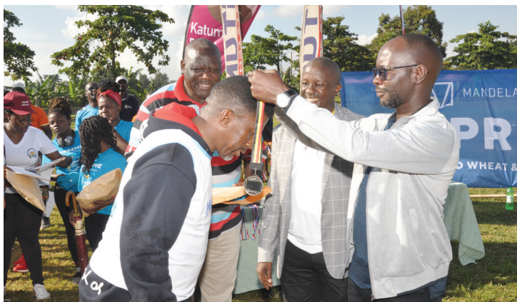
Nakawa Division Mayor, Eng. Balimwozo Nsubuga being decorated at the 3 rd MUBS Alumni run by the State Minister for Sports