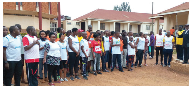
Staff at the Mbarara Regional Campus waiting to be flagged off

MUBS - Mbarara Campus in conjunction with the Main Campus, in Nakawa participated in the 3 rd MUBS Alumni run to raise tuition for people with disabilities. The annual run is intended to promote and create awareness about the need to support the girl child with disabilities attain University Education. The event took place on Sunday February 16, 2020 starting