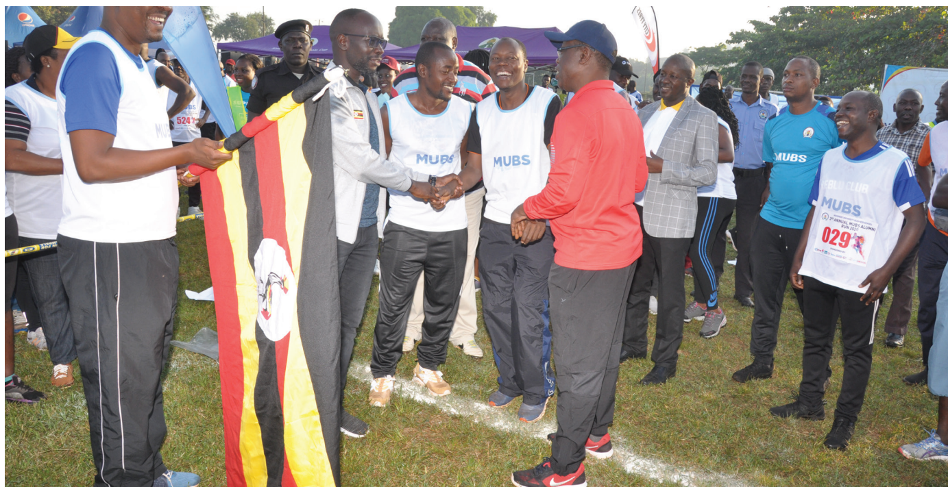
Hon. Hamson Denis Obua officiating at the event

Sunday, 16, February 2020, hundreds of people comprising of staff, students, alumni, friends and well-wishers assembled at the MUBS Main Campus, for the MUBS 3 rd Annual Alumni Run 2020, to fundraise money to help women with disabilities get access to University education.