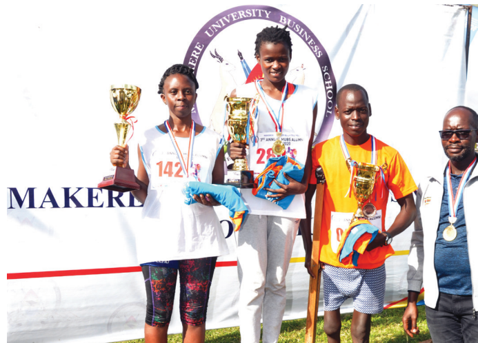
Winners of the 10KM race in the Women's category