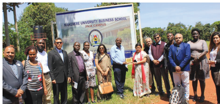
The Indian Delegation in a group photo with the campus top management

A delegation from India, Gujarat government made a courtesy visit