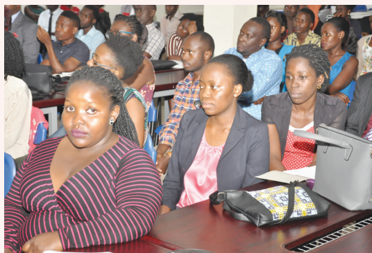
Students in the training

In its effort to increase compliance, Uganda Revenue Authority, (URA) in partnership with the Accounting Department, in the Faculty of Commerce on February 5, 2020, engaged Accounting students in tax discussions.