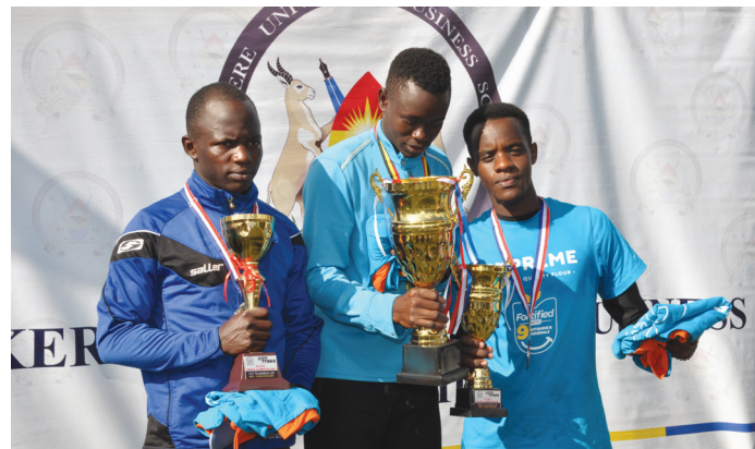
The winners of the 10KM race , Men's category