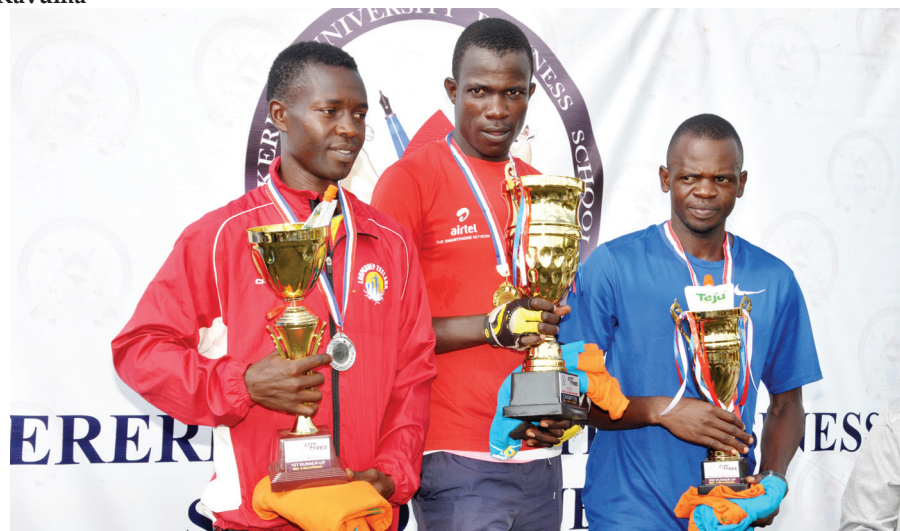
Winners of the 10KM race in the men's category