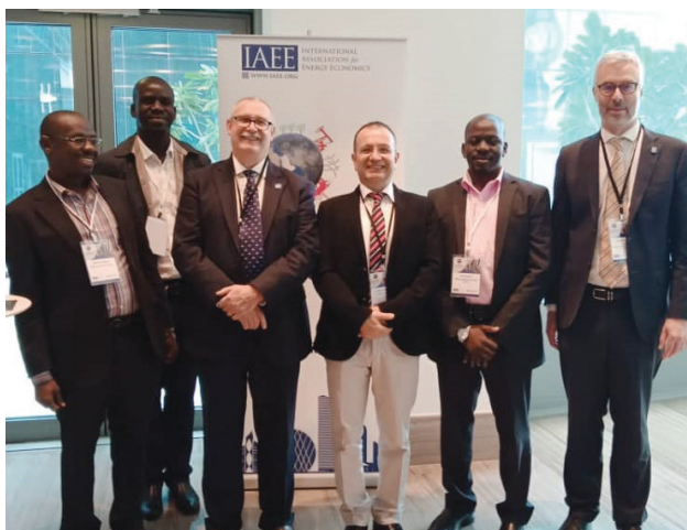
Team from the Norwegian University of Life Sciences, (NMBU) in a group photo with the MUBS team. NMBU has a collaboration with the Faculty of Graduate Studies and Research, MUBS