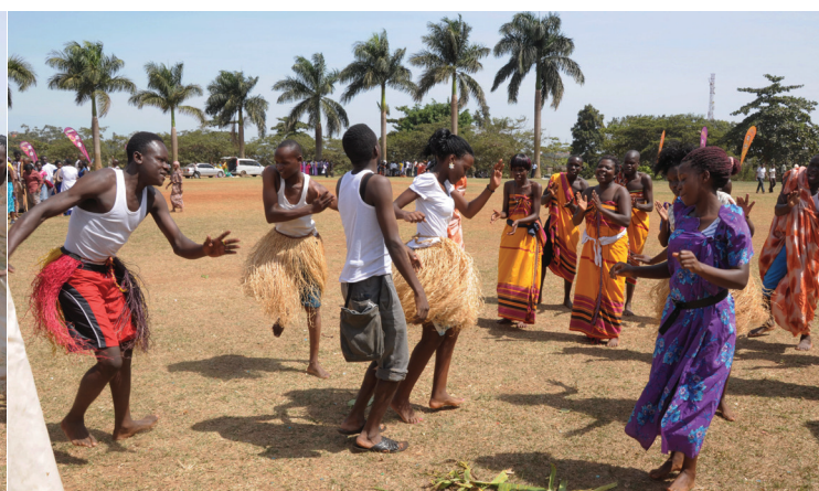
MUBS students during the MUBS Cultural Gala