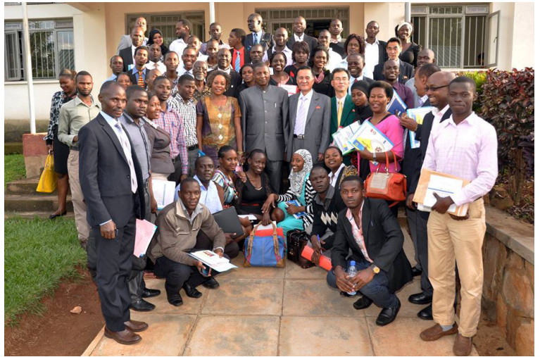
Participants of the JUCHE symposium in a group photo at Bugolobi Annex