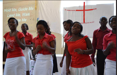
St. James Chapel choir singing during service.