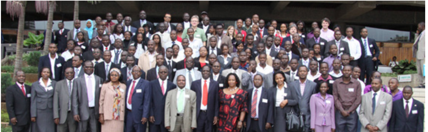
Operations Research Society of East Africa (ORSEA) conference participant