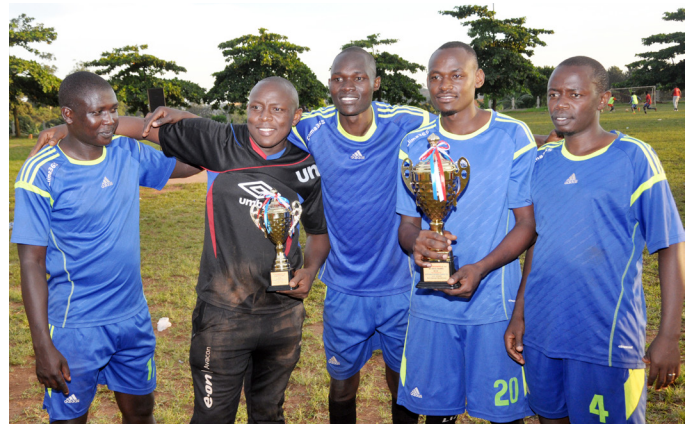
Faculty of Marketing Staff after their win