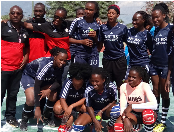
MUBS Female Volley ball team