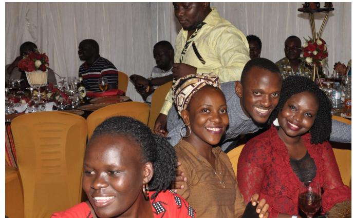
MUBS Staff enjoying the party