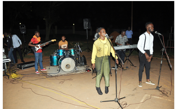
The band entertaining staff