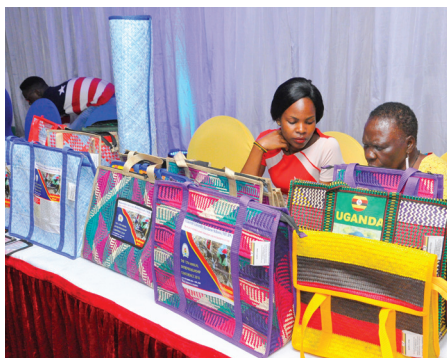
Exhibitors at the MUBS 13 th EIIC Conference

MUBS hosted young entrepreneurs from different universities in Uganda to discuss the role of incubators in developing entrepreneurship and creating new business start-ups that add value and impact to the society. The discussion was organized by the MUBS Entrepreneurship Innovation and Incubation Center (EIIC) as one of the events that kick started the MUBS 13 th Annual Entrepreneurship Conference which was held from October 24-26, 2018 at Hotel Africana in Kampala.