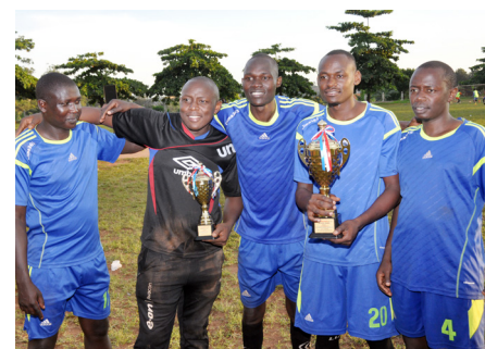
MUBS Academic staff after their win during the MUBASA Festival