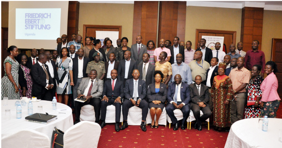
Participants in a group photo

Following the government's announcement of the rationalization of government agencies, commissions and authorities, Friedrich Ebert Stiftung organized a dialogue in cooperation with Makerere University Business School (MUBS) Economic Forum, titled "Rationalization of Government Agencies, Commissions and Authorities: Why, When, How and For Whose Benefit?" on December 4, 2018.