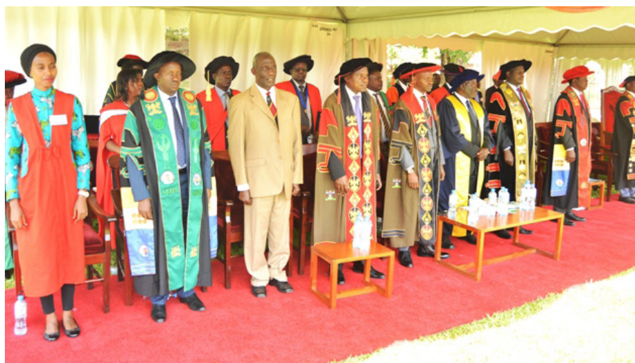
MUBS Management and MAK Management at the 69 th MAK Graduation