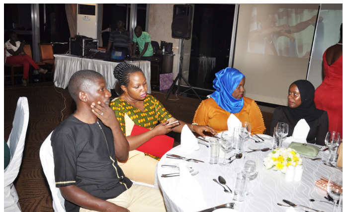
Some of the guests at the Dinner