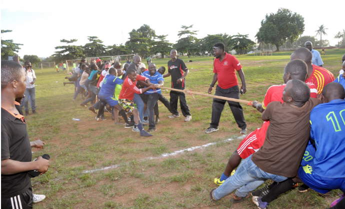
MUBASA Staff take on the Tag of War