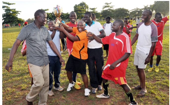
Faculty of Entrepreneurship and Business Administration Staff after their win