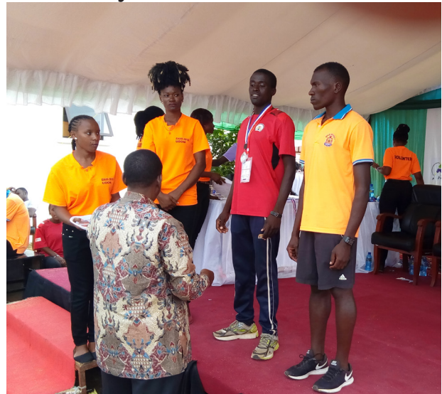
MUBS Athlete receives a bronze medal for 5000 metres