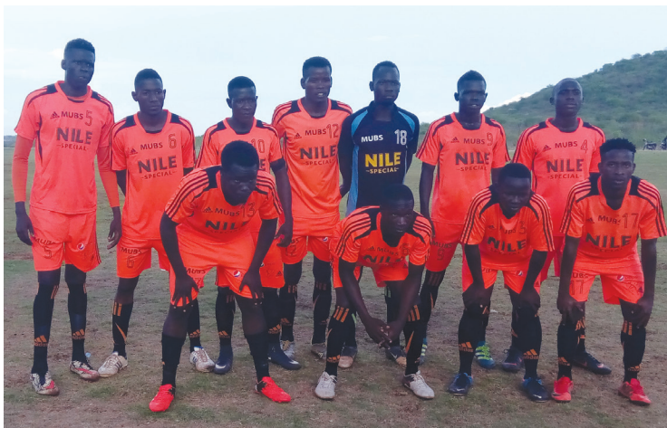
MUBS Male football team