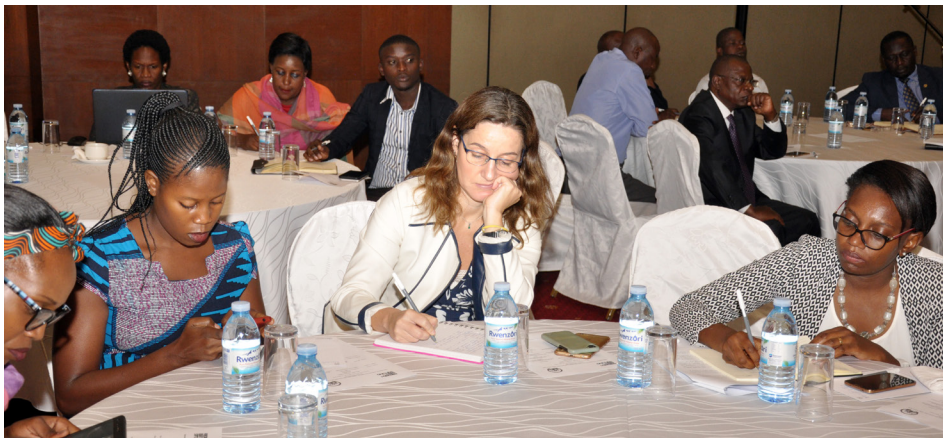
Participants to the Economic Forum Rationalization workshop