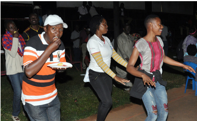
MUBASA Staff Jinja Campus show their dance moves