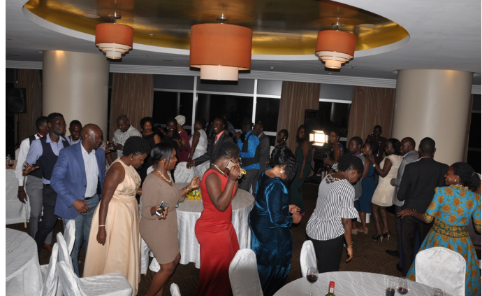
Guests dancing to the music