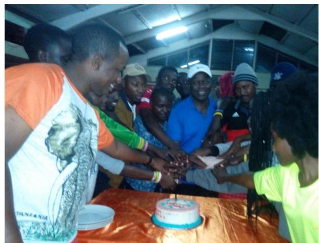
MUBS Athletes cutting a cake to celebrate their victory

THE 9 TH EDITION OF THE EAST AFRICA UNIVERSITY GAMES kicked off on December. Universities from Kenya, Uganda, Rwanda, Burundi, South Sudan, Tanzania came together in December 2018 to compete in various game disciplines from soccer, swimming to board and indoor games at Dodoma University in Tanzania. MUBS Contingent to the Eastern Africa University games had 90 people (74 athletes and 16 officials),