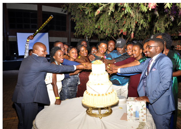
MTN and MUBS staff cutting cake