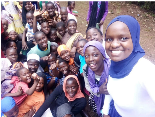
MUBSMSA members in Eastern Uganda during their CSR project

A group of 62 students from the Moslem students community under their umbrella body, Makerere University Business School Muslim Students' Association (MUBSMSA) and the Office of Imam organized a seven day 17 th -25 th December community outreach program in Eastern Uganda, where they carried out a number of activities including hospital visits, community cleaning, mosques painting, community