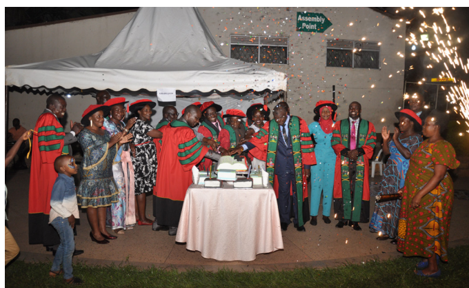
Graduands cutting cake with their family members

The graduands were hosted to a party organized by the Faculty of Graduate Studies and Research to celebrate their victory.