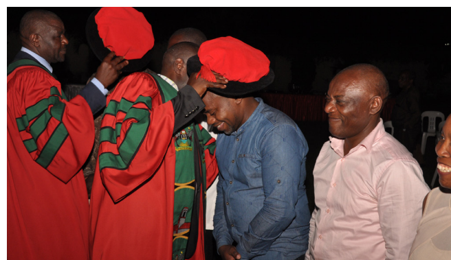
Graduands blessing those that are still pursuing their PhD's