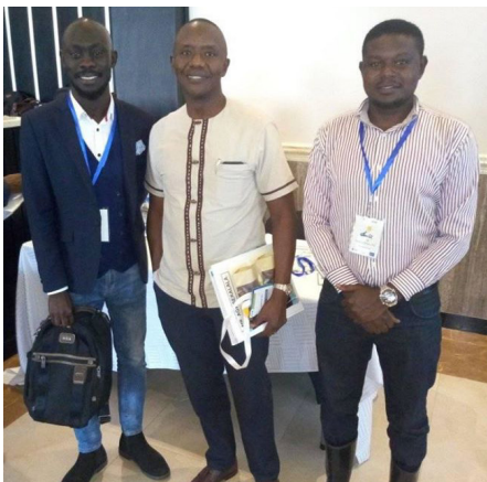
NSSF Hi-innovators challenge winners

On November 9, 2019, the NSSF Hi-innovators' challenge was concluded. The seed fund saw 6 winners out of 150 businesses that joined the competition. This was organised alongside Outbox Hub and MUBS Entrepreneurship,