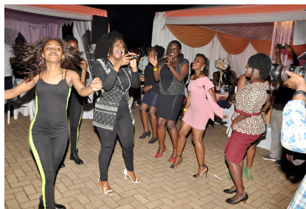
Staff join musician Rema Namakula as she performs at the party