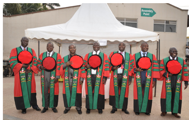
Graduands show gratitude for the support rendered to them throughout their PhD journey