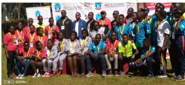
MUBS Sports Team in the group photo after receiving medals at the 18 th Inter-University Games

Tennis (Men) and Table tennis(Men), 2 Silver medals in Volleyball (Ladies) and Woodball (Silver), 6 Bronze medals in Swimming, Chess, Tennis, Table tennis and lastly Woodball (Ladies) in the different sports disciplines. Out of the 8 universities, MUBS settled in the 4 th place with 11 points behind Ndejje University, Makerere University, and Kyambogo University. The University was well represented and we congratulate all Sports men and Women who managed to participate in the tournament.