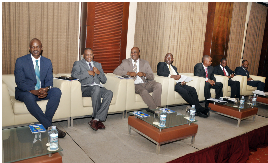
Panelists at the Economic Forum

On December 10, 2019, the MUBS Economic Forum and Friedrich-Ebert-Stiftung launched the research report & public forum. The launch that took place at Kampala Serena Hotel was held under the theme; “from paper to practice: implementation of Uganda’s industrialization agenda.”