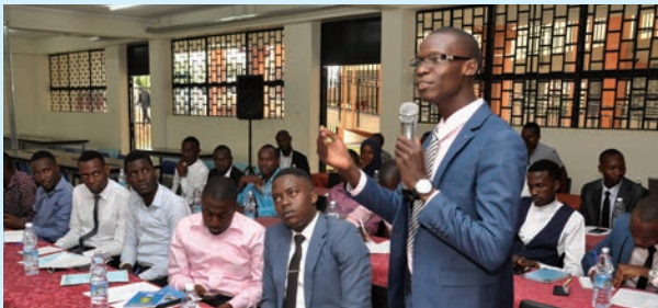
Some of the Guild Leaders in the training