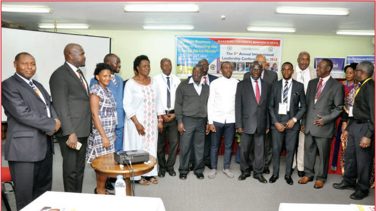
H.E. Edward Kiwanuka Ssekandi in a group photo with Members of Parliament, MUBS Council members and participants at the MUBS 8th AILC 2018 in Entebbe.

The African Business community has suffered perennial lack of adequate capital and entrepreneurial skills