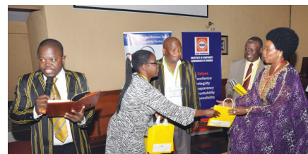
S. African team appreciating the MUBS team

their University is working on a Memorandum of Understanding with MUBS to create a platform to strengthen leadership and governance participation in Africa.