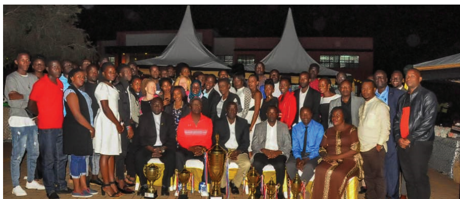
MUBS sports team displays all the trophies the School won through Academic year 2018/ 2019 at the School Sports Dinner