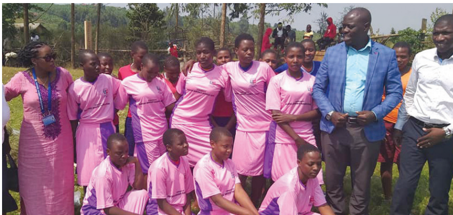
MUBS team handed over sport wear to students of Kyeibare Girls School

In addition to helping young people in Secondary schools make right career decisions, MUBS through the Career and Skills Development Centre has embarked on promoting sports activities in Secondary schools in the country. On June 20, 2019, the Centre donated sports