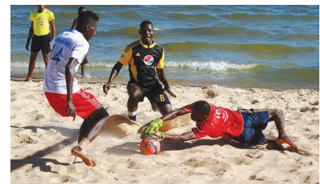
MUBS Beach Soccer team