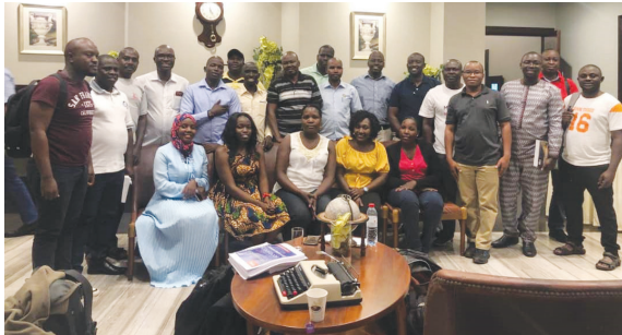
The participants in Dubai

Three (3) of MUBS staff were among the thirty three (33) participants from the seven (7) Higher Education, Science and Technology (HEST) Institutions who were sponsored by the African Development Bank to undertake certification courses.