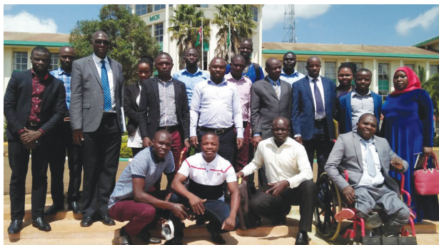
MUBS students and Moi University staff

A team of fourteen (14) students pursuing a Masters of Energy Economics and Governance visited Moi University, Phytochemicals, Textile Engineering, Industrial Engineering and Renewable Energy, PTRE center at Moi University on July, 1, 2019.