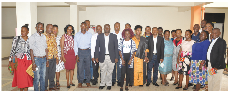
A group photo with the Faculty staff after the workshop