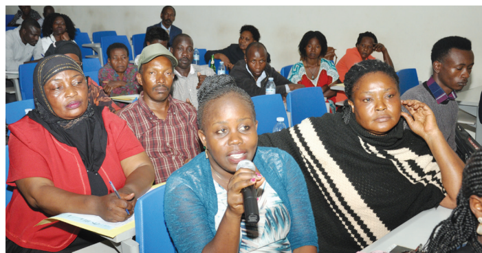
Some of the Nakawa Division councilors who attended a leadership training at MUBS. The training was organized by the MUBS Leadership Centre on June 18, 2018, as one of the activities for the 9 th Annual International Leadership Conference 2019. They were trained on the role of leadership in governance.