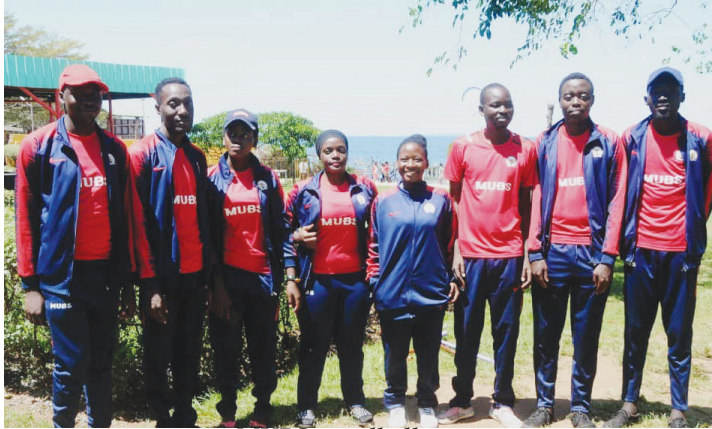
MUBS woodball team

MUBS woodball team competed in 6 th Uganda International Woodball Open championship 2019, that took place at spinnah Beach Entebbe from May 29-30, 2019. Despite the tight competition, the team completed in the 4 th position.