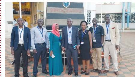
MUBS team at MKU

Under the funding by the African Development Bank (AfDB), the MUBS elearning Centre team visited Mount Kenya University (MKU) in Thika to carry out a benchmark visit with its process and systems. The team visited MKU between April 15 -19, 2019. The six (6) delegation was led by the Principal, Prof. Waswa Balunywa. MKU was selected as one of the institutions that MUBS could benchmark from its presence in providing online learning not only in Thika but also in various regions including Uganda.