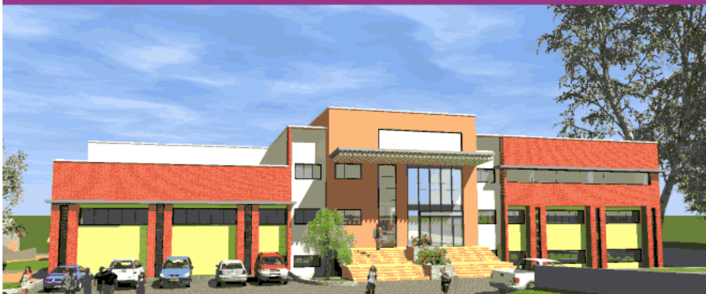
The artistic impression of the Faculty of Computing and Management Science