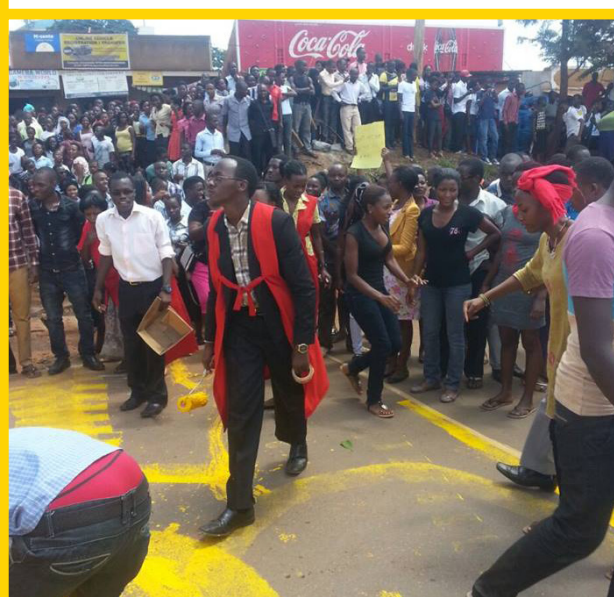
MUBS Students painting zebra crossing at the Nakawa trading centre in memory of the two students who were knocked dead by a speeding car