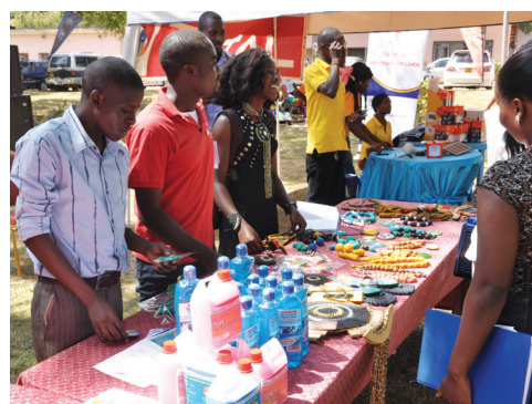
Social entrepreneurs exhibit their product in commemoration of the International Women's day, March 8