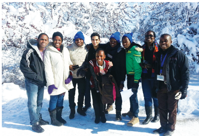
MUBS students at Drake University

As part of the exchange programme between Makerere University Business School (MUBS) and Drake University a group of eight (8) MUBS undergraduate students were at Drake for a three weeks study-abroad tour. The students accompanied by their lecturers were in the United States to