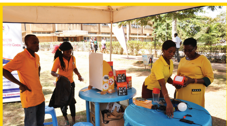
Some of the entrepreneurs who exhibited their product to mark the International Women's day which was celebrated by MUBS on March, 9, 2015 at the Nakawa campus