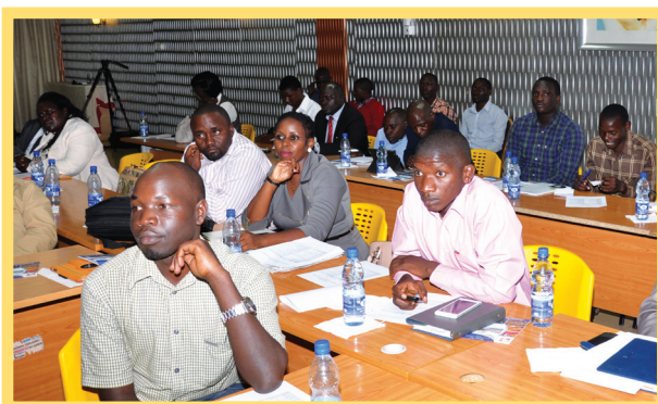
MUBS Staff at the book launch at Hotel Africana