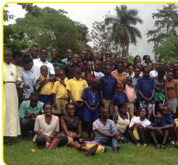
A team of st. Charles Lwanga of St. Padre Pio, Catholic Mugagga Boys Home in Jinja a home of disadvantaged children but visiting and having fun with them, lightened their