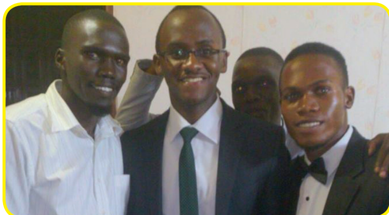
March 19, 2016, the MUBS Guild President attended a dinner organized by MUBS Students, of the BPSM Class, at Chong Qing Restaurant. The students were celebrating the registration of their company, "The Elite Group Investment Club And Prolites Logistics"