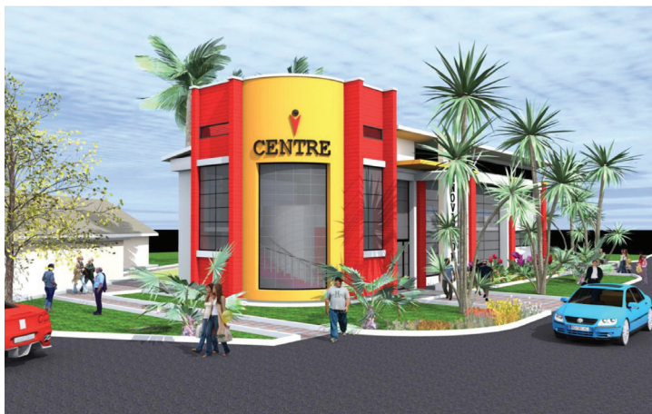
Artistic impression of the Incubation Centre

The Strategy & Projects Unit coordinates the School's strategic direction and runs various projects in the School particularly infrastructure and furnishing of lecture halls/ rooms and offices.