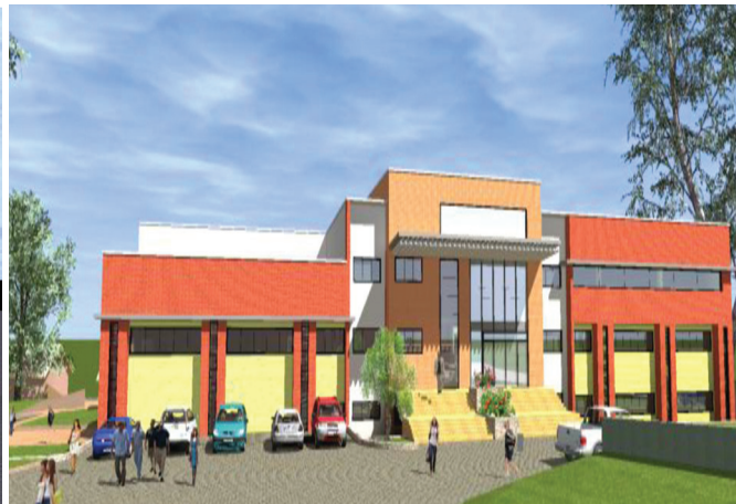
Artistic Impression of the Faculty of Computing and Management Science