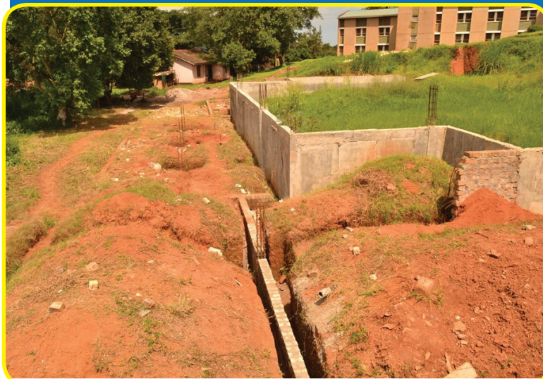
One of the on going projects in MUBS: construction work at St. James' Chapel MUBS. Thank you for supporting God's work. Please continue to pray and give towards God's work.