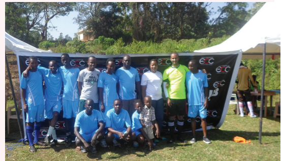
MUBS team during ECC outing at Cricket Grounds Mbale

MUBS has for two years participated in the Eastern Corporate Club which club brings together the corporates in Mbale to network together. The Campus members have been able to meet and interact with different member institutions in