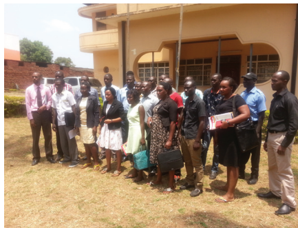
Some of new Bachelor students pause for a group photo with the Campus Director (5th in the behind line from left)

On March 23 rd the Campus received visitors from CPA (U) to talk to students about their Careers. This was about orienting students about the latest development in the accounting sector and to guide them about making career choices as far as accounting is concerned.