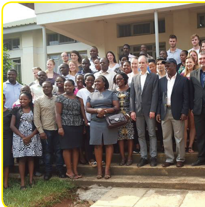
MUBS- CBS staff and students in a group photo during their March Visit to the School. MUBS has linkages with different universities in different parts of the world. These universities send visiting professors and students to Uganda to visit MUBS and similarly now and again if it can afford sends its students and staff to these universities. A group of professors and students from Copenhagen Business School are here for a period of three