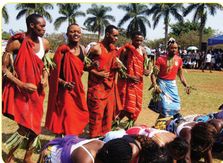
March 28, 2016 was a remarkable day at MUBS for students who participated in different activities depending on their culture during the MUBS-cultural-gala