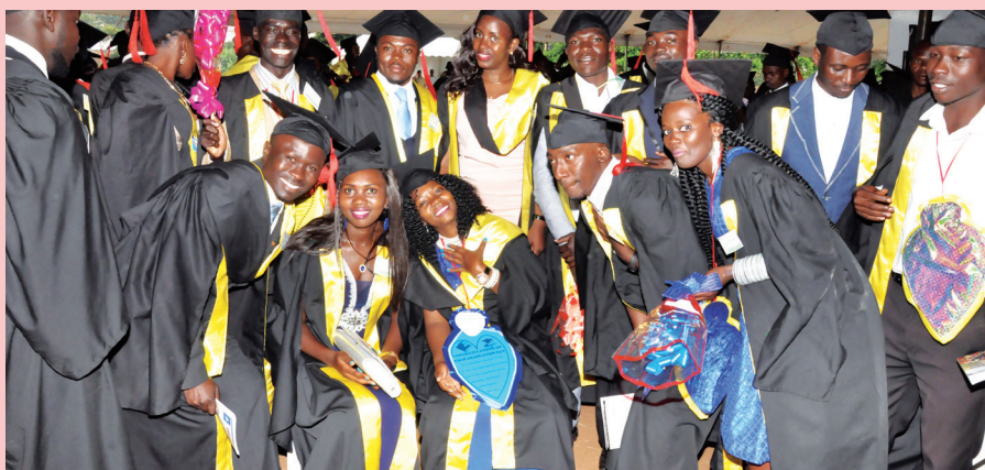
MUBS graduates at the 13th Graduation Ceremony