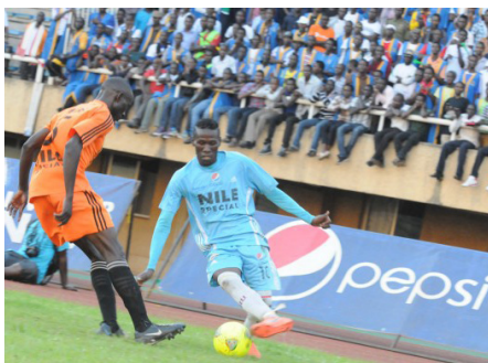
Action between MUBS and Kyambogo University in a previous game