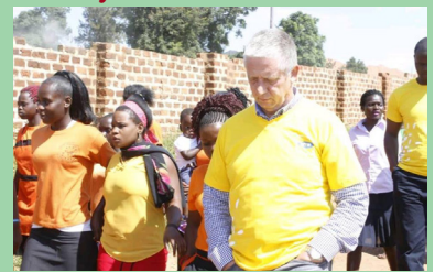
MUBS-MTN staff CRS in Kawempe Division

On June 1, 2018 the MUBS Entrepreneurship Innovation and Incubation Centre started working together with MTN Uganda carried out their "21 days of Y'ello care". The Giving back to the community campaign was launched in Kawempe division at Kawempe Youth Development Association (KYDA). It kicked off with cleaning up the area with the help from Kampala City Council Authority. All the plastics collected during the exercise were handed over to KYDA to be recycled into dust.