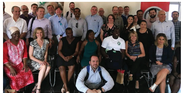
MBA UK students in a group photo with Teheca

Teheca are in their business start up phase and they have been selected as the only start up in Uganda to participate in the Google Pad taking place in Nigeria this year. They were contacted by the Daniel's College