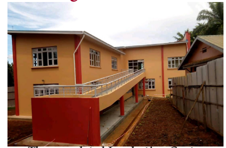
The completed Incubation Centre