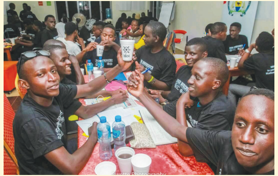
Entrepreneurs attending the 24 hour boot camp at Makerere University Business School