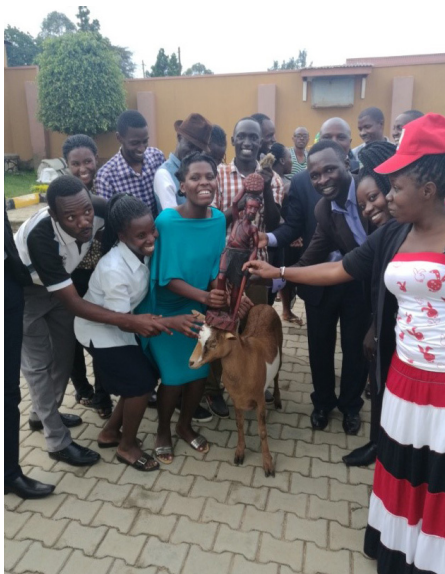
The winners of the Cultural gala

Never in the last one decade of MUBS Regional Campus – Mbarara history, had a cultural group won the Cultural gala competition in a consecutive Academic years until now 2017/2018 when the granddaughters & sons of Entare ya Tooro & Omukama Kabalega have done it.