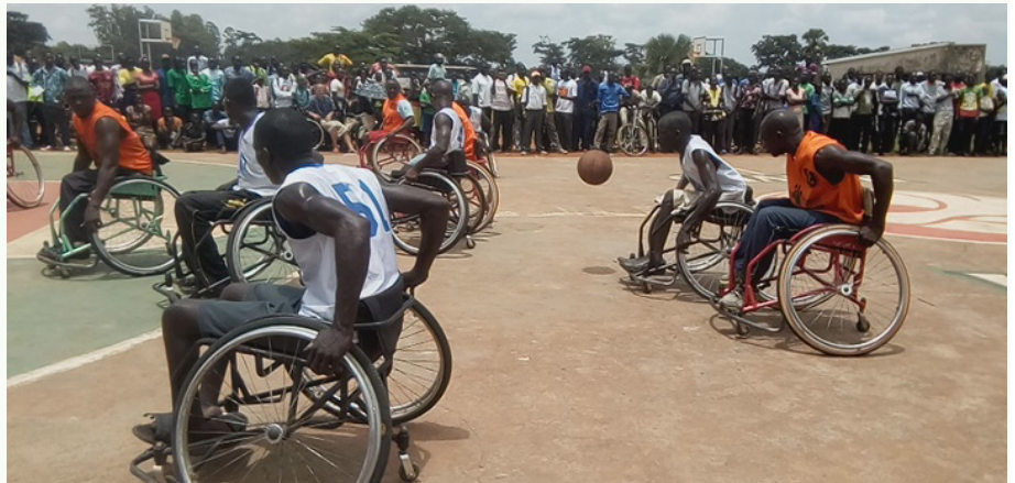
Some of the students with disabilities who partied in the games