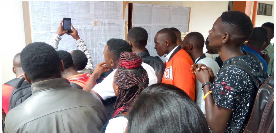
Students checking for their results