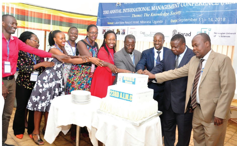
The Minister for Justice and Constitutional Affairs Rtd. Gen. Kahinda Otafire (2 nd right) cutting a cake with MUBS staff at the 23 rd AIMC in Mbarara. He officially opened the conference and asked people to work hard and stop bothering God. "He said the problem with Ugandans and most Africans is that when they are faced with problems, they resort to praying to God instead of working to solve their problems"