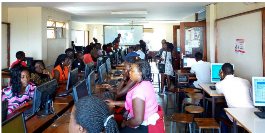
Students of Business Computing attending computer lessons in the MUBS computer labs, level 3 of the Main building