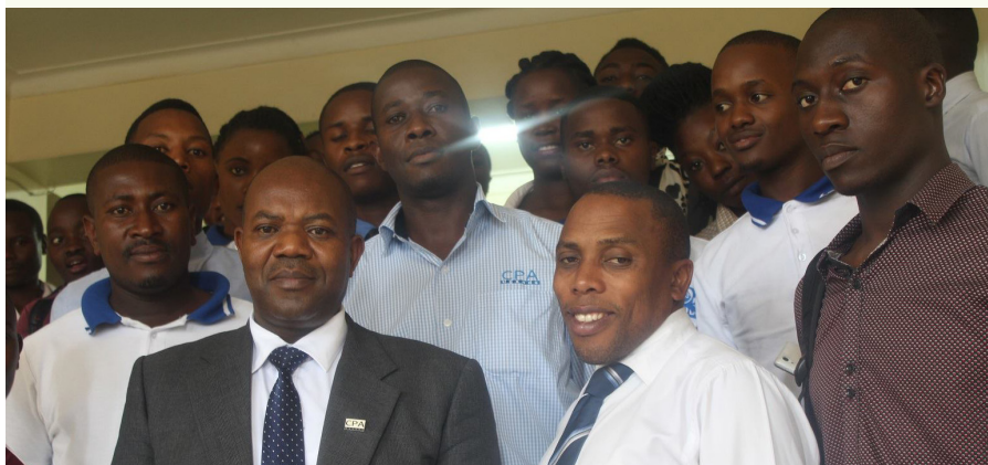
ICPAU officials in a group photo with the students

On 26th September 2018, the Accounts Students Association of Makerere University (ASAMU). Mbarara Regional Campus hosted ICPAU at their Campus.