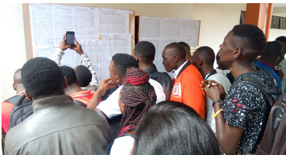
Students lining up on School noticeboards to view their 2017/18 Examinations Results which were officially released on September 5, 2018