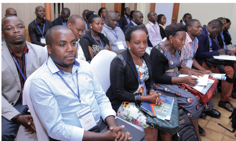
Some of the MUBS staff who attended the conference