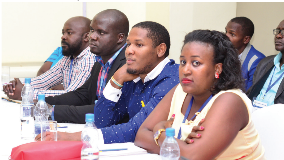
Some of the MUBS staff at the AIMC in Mbarara

The Minister was opening of the MUBS 23 rd Annual International Management Conference which was held in Mbarara from September 11- 14, 2018 under the theme “Creating a Knowledge Society”.