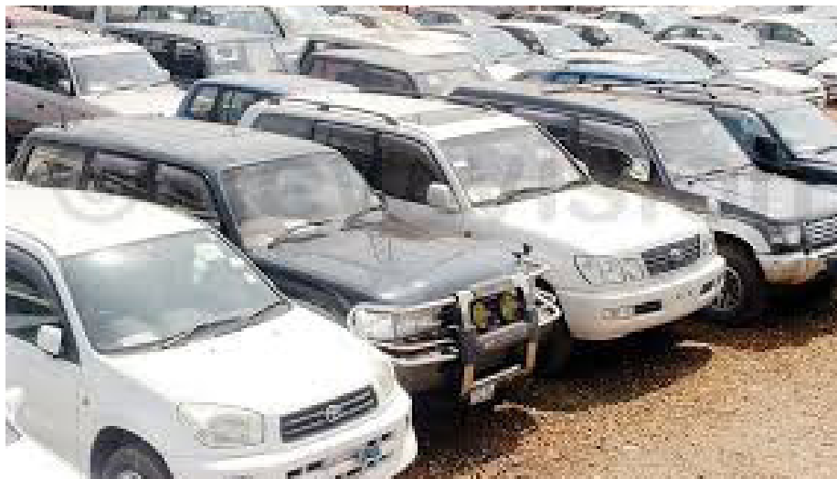
Cars parked in the designated area

Management is calling upon all the stakeholders to comply with the new security measures.